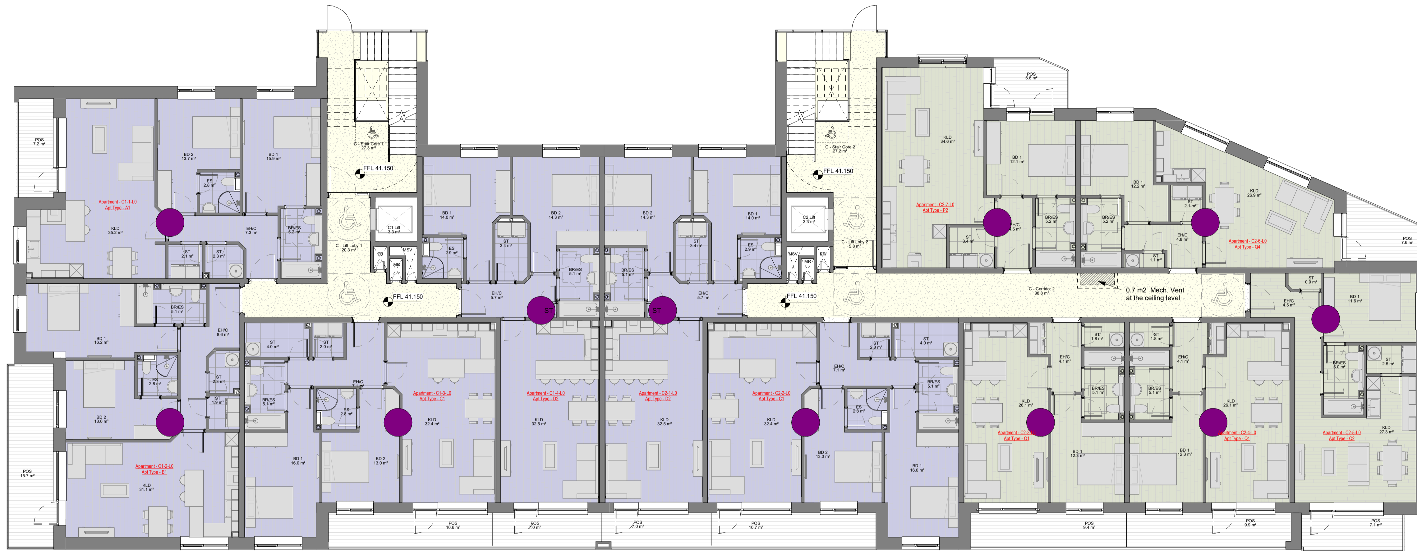
1 GA Part V - Ground Floor Plan 1 : 100